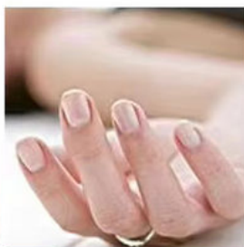
Cure Ringworm of The Nails