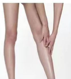
Blood Vein Removal